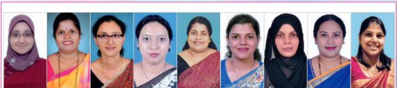
M.Ed Batch 2023-24