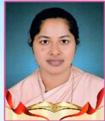
STELLA DELPHIN SOPHIA III Topper