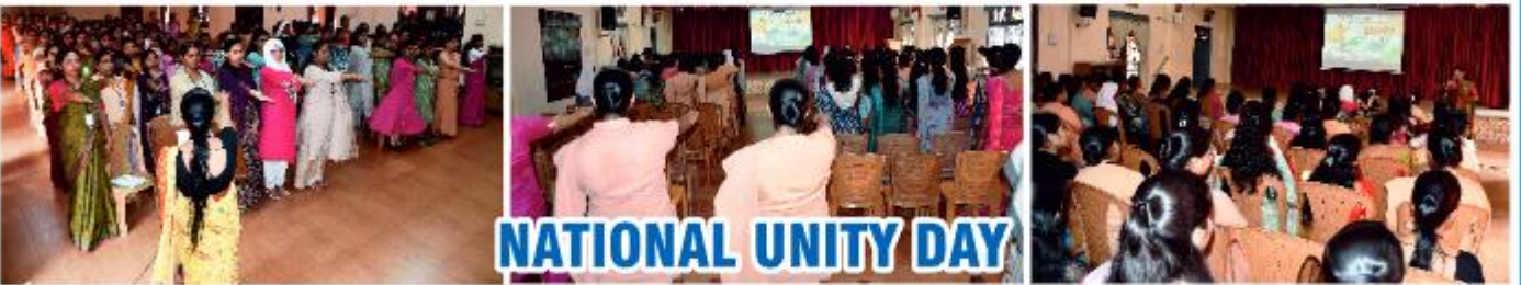
NATIONAL UNITY DAY