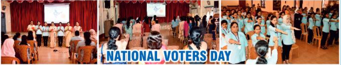
NATIONAL VOTERS DAY