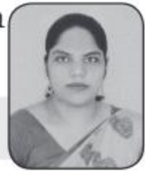
Farheen B.Ed. I Year

Globalization, environmental degradation, and social inequality, continue to shape the world in complex base. Amidst these challenges education stands as a beacon of hope for fostering sustainable development. More than just a means of acquiring knowledge, education is a transformative force that equips individuals with the skills, values, and attitudes necessary to build a sustainable future. The United Nations recognizes education as a pivotal driver for achieving the Sustainable Development Goals (SDGs), particularly Goal 4: Quality Education.